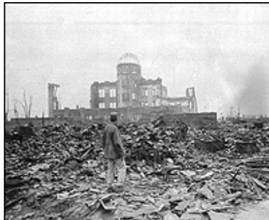
An allied correspondent stands in a sea of rubble before the shell of a building that once was a movie theater in Hiroshima, Sept. 8, 1945.

Inside are photographs of victims grotesquely scarred, of bodies burned beyond recognition, and countless black-and-white photos of school children draped with tattered clothing, with skin peeling off their faces.